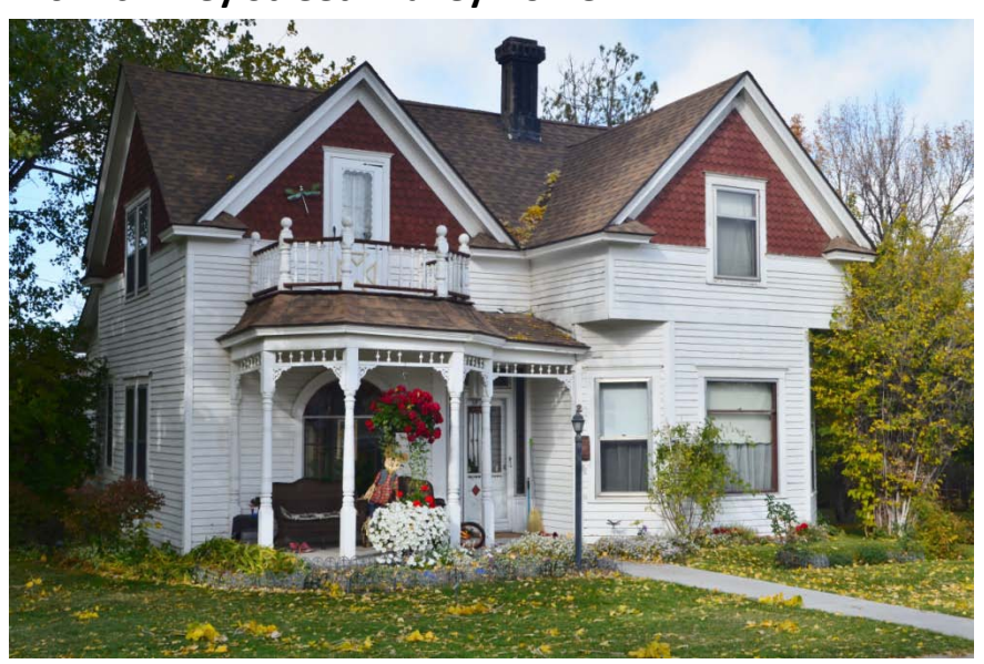
373 Van Buren Street - Spence Home